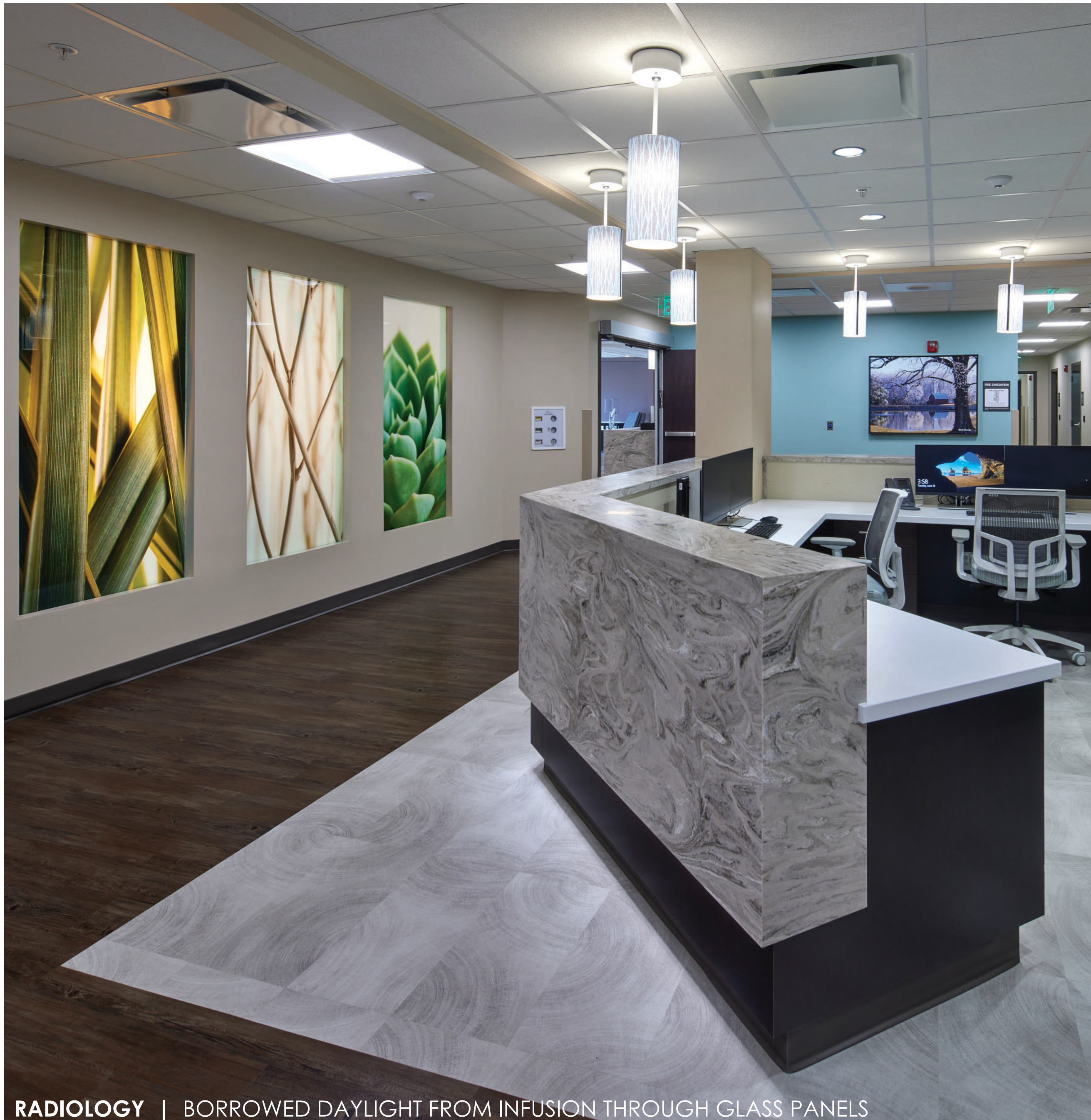
RADIOLOGY | BORROWED DAYLIGHT FROM INFUSION THROUGH GLASS PANELS