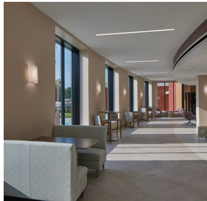
VARIETY OF SEATING