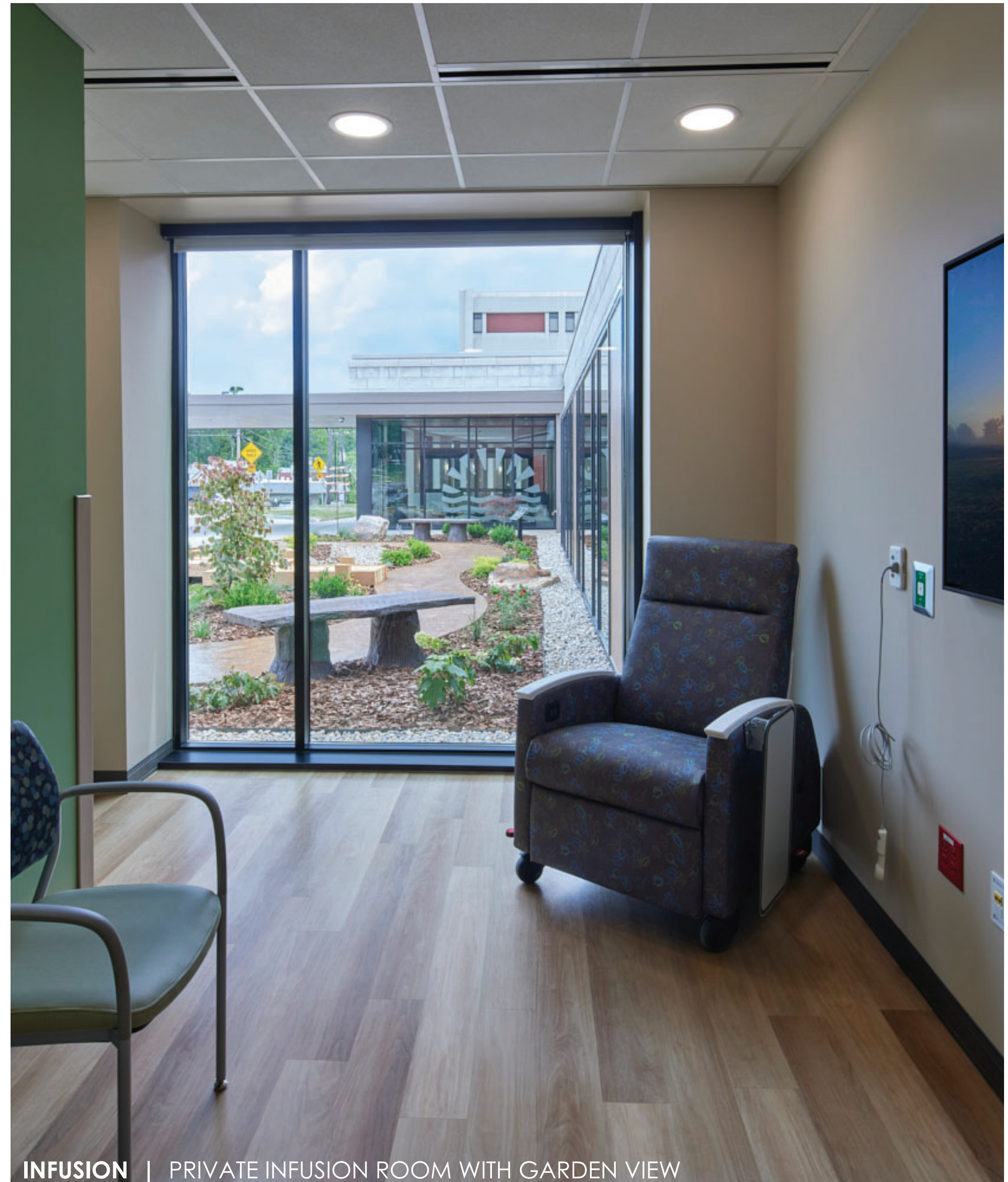
INFUSION | PRIVATE INFUSION ROOM WITH GARDEN VIEW