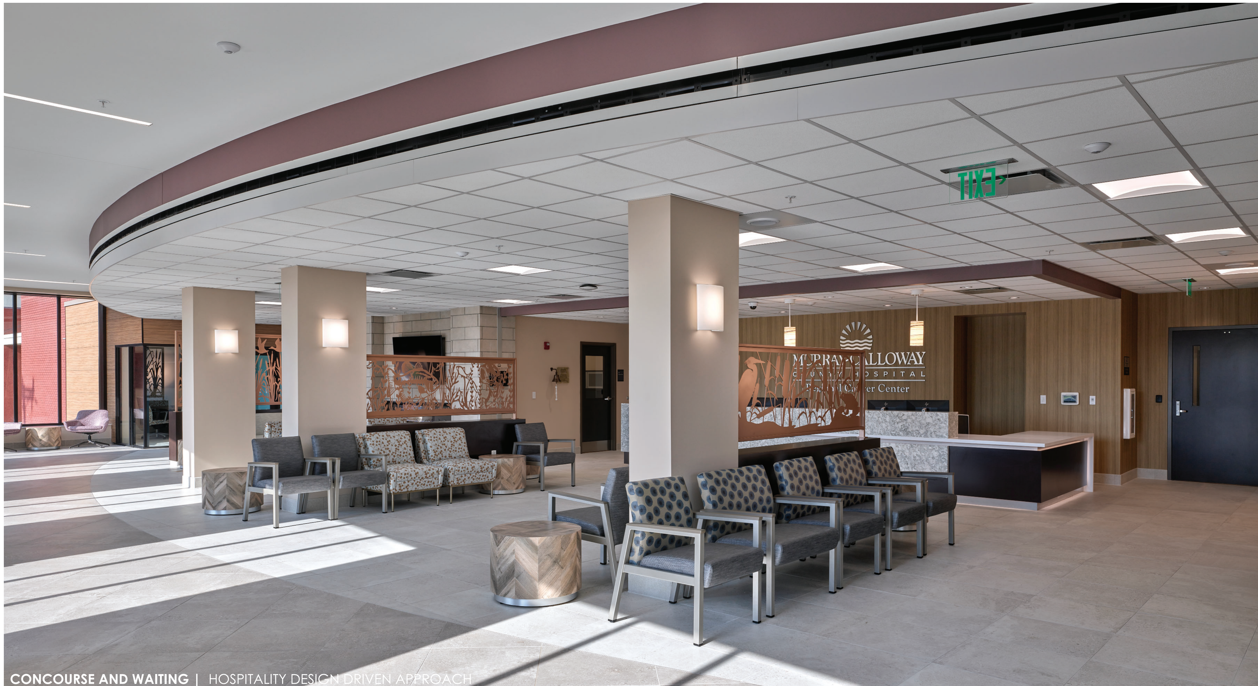
CONCOURSE AND WAITING | HOSPITALITY DESIGN DRIVEN APPROACH