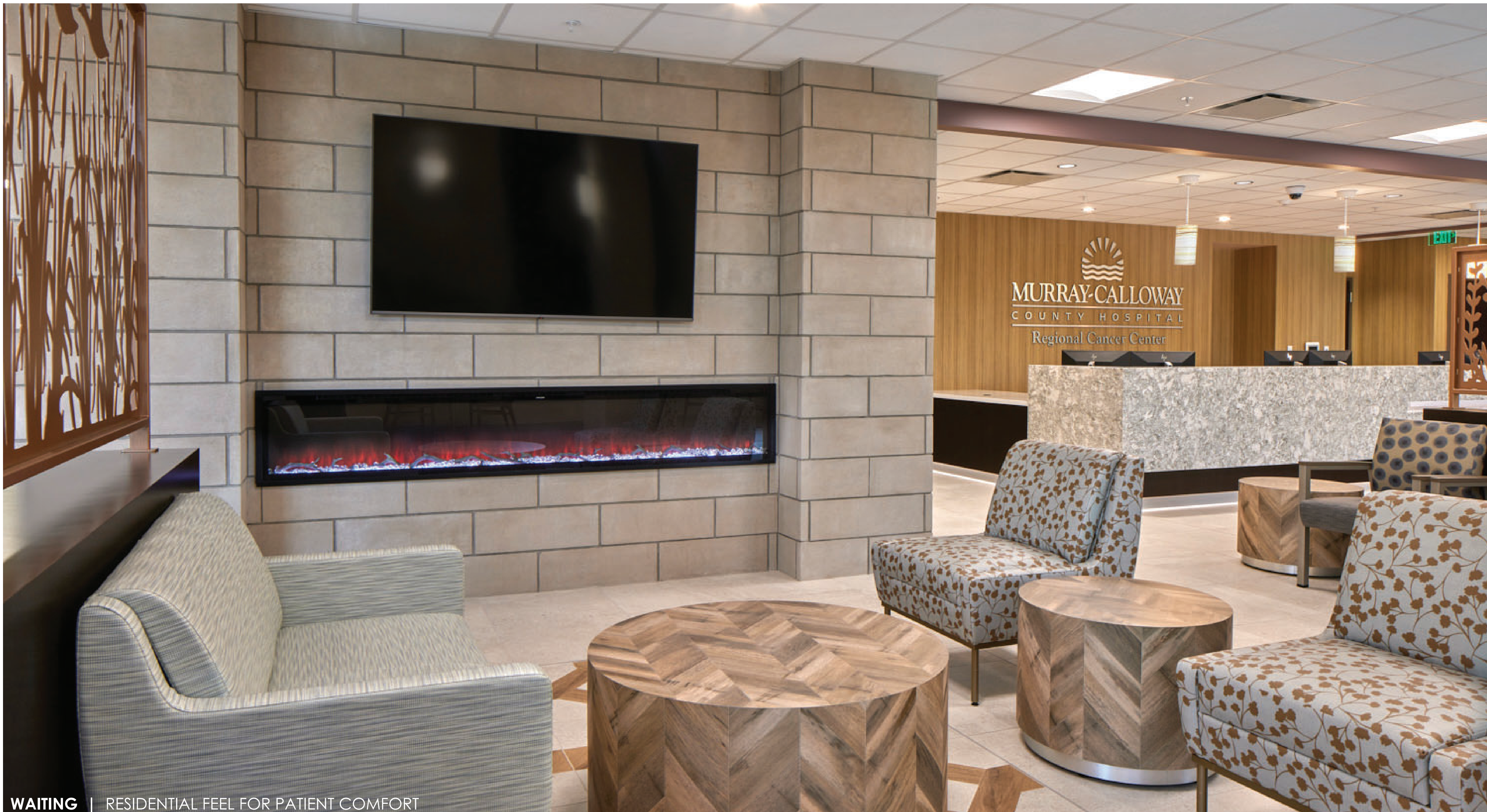
WAITING | RESIDENTIAL FEEL FOR PATIENT COMFORT