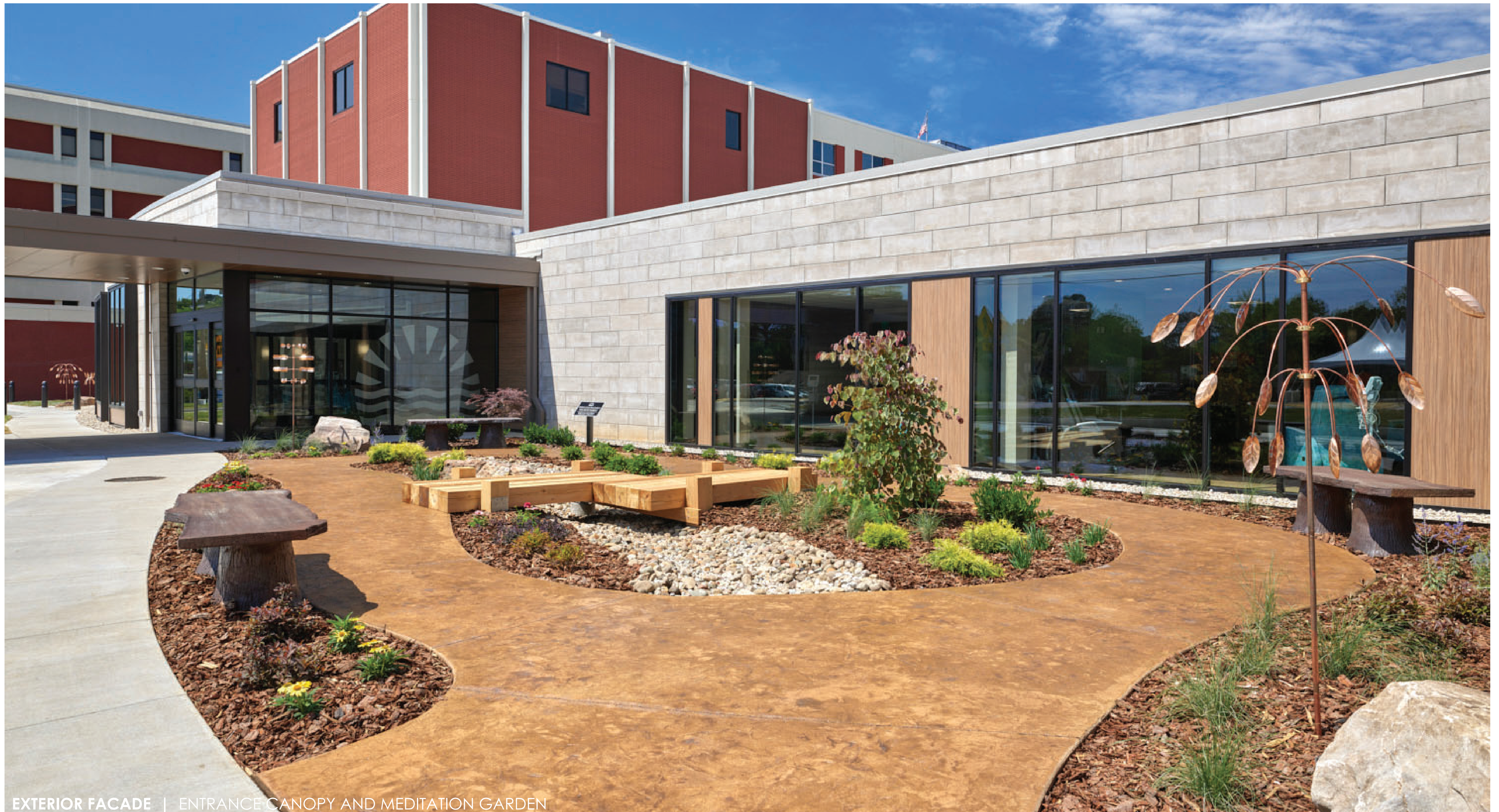
EXTERIOR FACADE | ENTRANCE CANOPY AND MEDITATION GARDEN