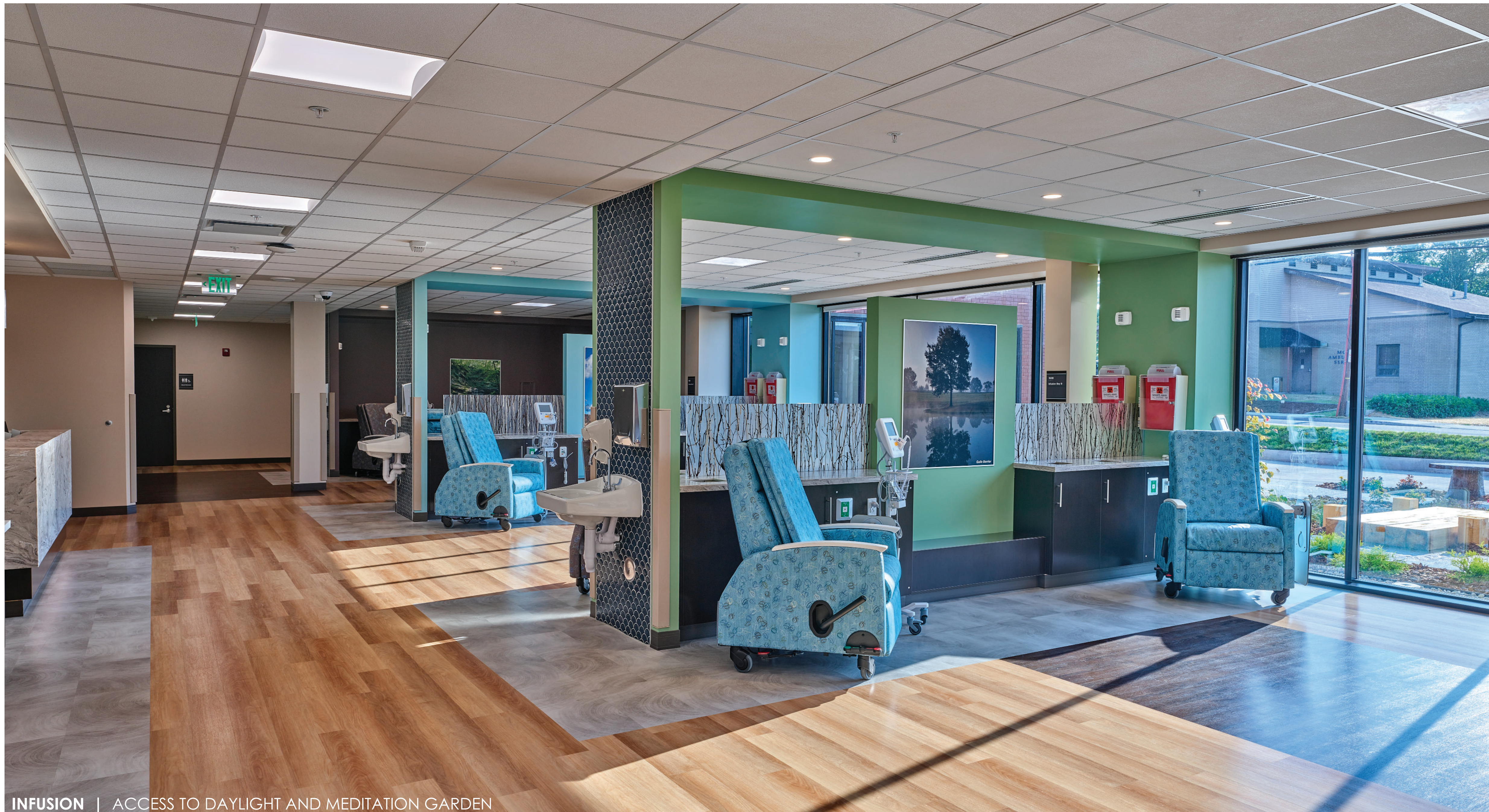
INFUSION | ACCESS TO DAYLIGHT AND MEDITATION GARDEN